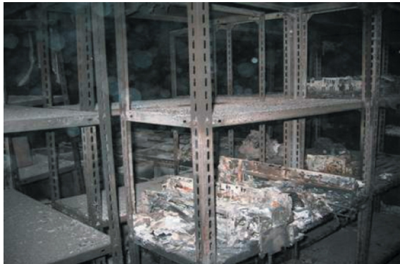
Storage room in basement of Revolutionary Command Council Headquarters. Burned frames of PC workstations visible on shelves. All rooms sharing walls with this storage room were untouched from fire or battle damage.