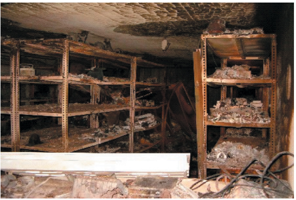
Ministry of Foreign Affairs. The basement historical files were systematically selected and destroyed.

What have we found and what have we not found in the first 3 months of our work?