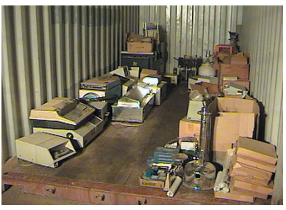
Lab Equipment From Mosque.