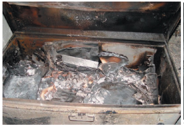
Burned Documents Found at SAAD Center: An exploitation team on a recent mission to the SAAD Center, part of the Baghdad New Nuclear Design Center, found massive looting and the remnants of deliberately destroyed documents. Other documents were left untouched, however, and recovered by the team.